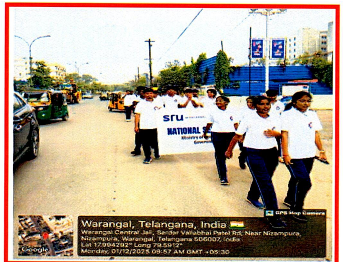
Caption: - "Raise awareness. Save lives. Stop AIDS."